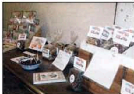
The company sells dried cherries in various packages.